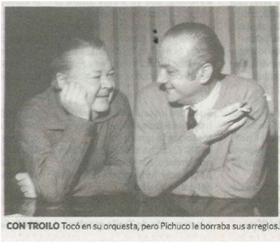
CON TROILO Tocó en su orquesta, pero Pichuco le borraba sus arreglos.

Around this time, the bandoneon player had also begun playing with the best tango orchestra in Buenos Aires, Anibal Troilo's Orquesta Tipica. He played second bandoneon to Troilo for eight years.